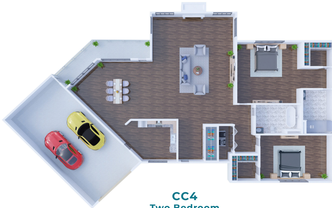
CC4 Two Bedroom 1,286 SQ FT