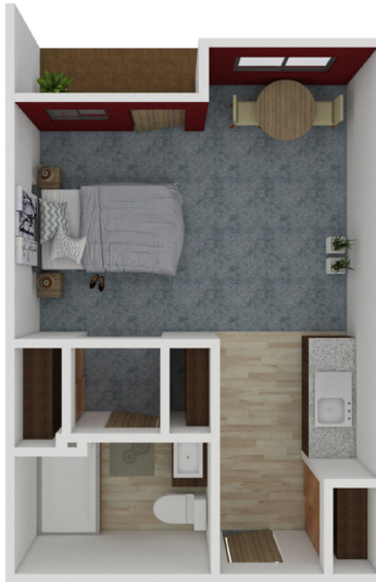
A1 Studio 405 SQ FT

Solstice at Lee's Summit offers several floor plan choices to suit your needs.