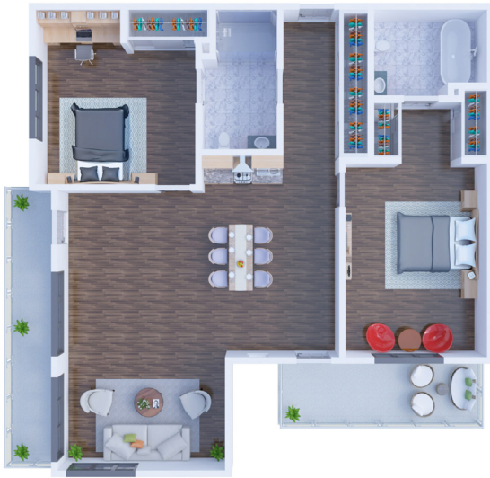
C1 Two Bedroom 1,055 SQ FT