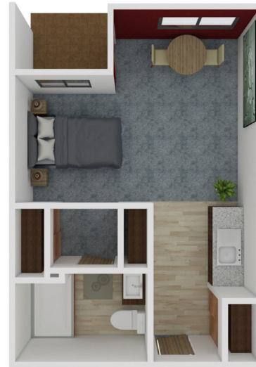
A3 Studio 400 SQ FT