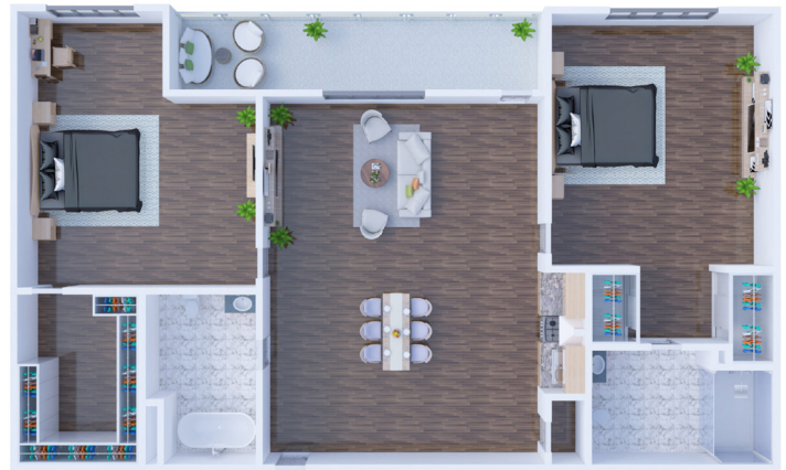
C6 Two Bedroom 935 SQ FT