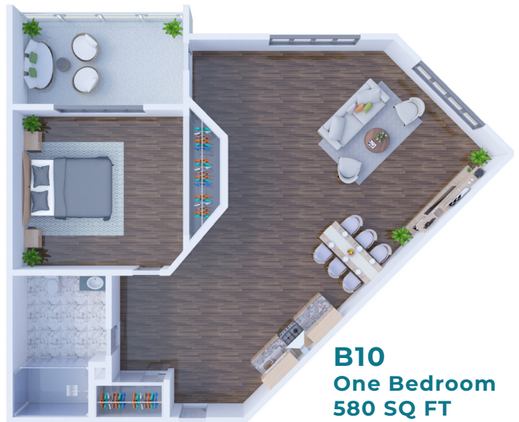
B10 One Bedroom 580 SQ FT

Solstice at Lee's Summit 1098 NE Independence Avenue | Lee's Summit, MO 64086 844.823.7775 SolsticeAtLeesSummit.com