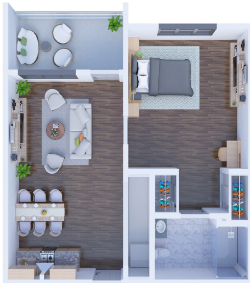
B1 One Bedroom 550 SQ FT